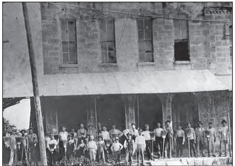
The Round Rock Broom Factory